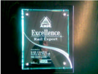
Excellence in Rail Export Award presented to KDR Creative Software

Since introducing our FMMS product to the Asset Management Software Market in 1991, KDR Creative Software has assisted a very broad cross-section of Industry to get the most out of their assets.